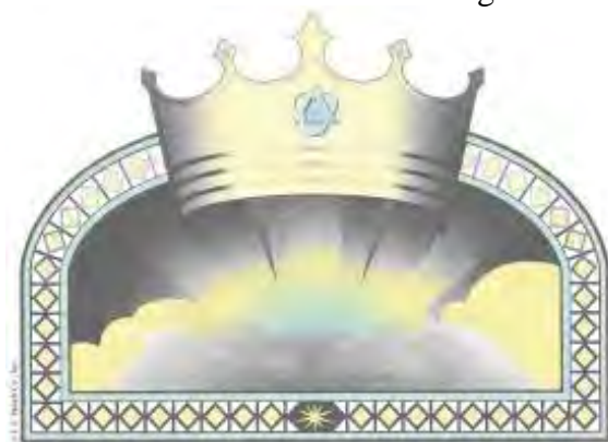
Honor and power to the King of Kings