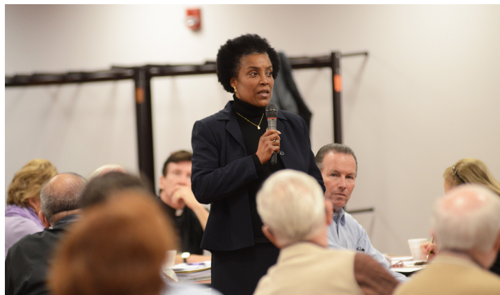
Lots of questions and lively discussions surfaced during the Faith In Our Future Cohort training sessions held in mid-March throughout the four-county Diocese. Here, a Burlington County parish core team member takes the microphone during the session held in St. Isaac Jogues Parish, Marlton. For full coverage of this training session, visit TrentonMonitor.com and click on NEWS>OUR DIOCESE.

The 20 or so members of the Planning Commission are priests, deacons, women religious, and lay men and women from all four counties of the Diocese who have been identified because of their experience in the