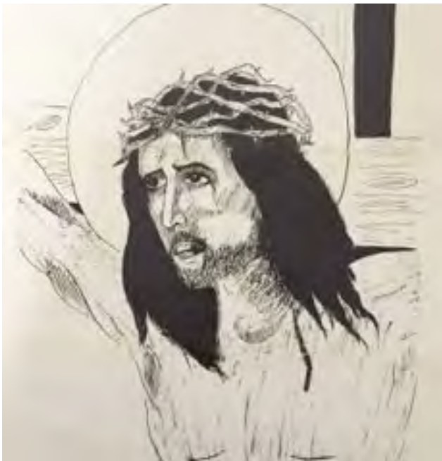
The above drawing was done by an anonymous bona fide parishioner.