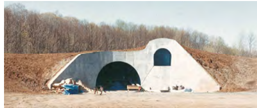
Planning and Construction 1987-1992